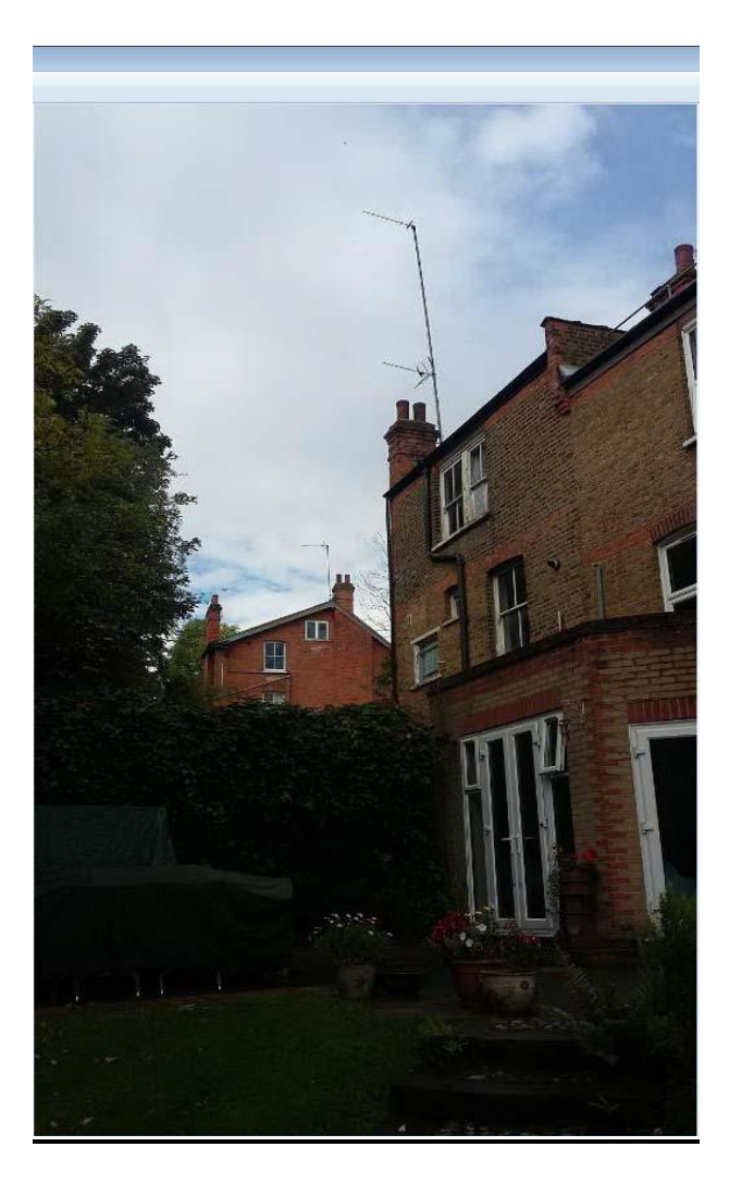
Site photo – rear of the site, (photo taken from neighbouring no. 78 Woodland Gardens)