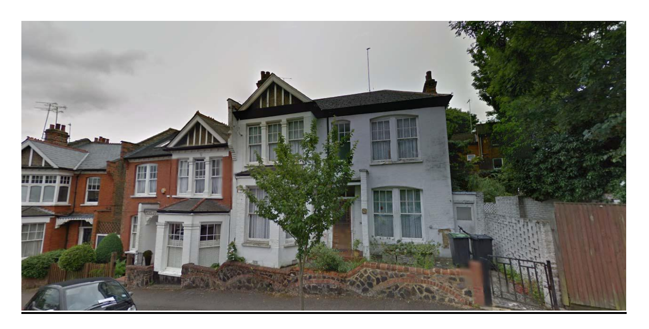
Site photo - frontage of current dwelling on site