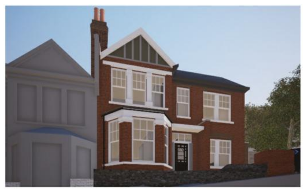
Visual impression of the proposed frontage.