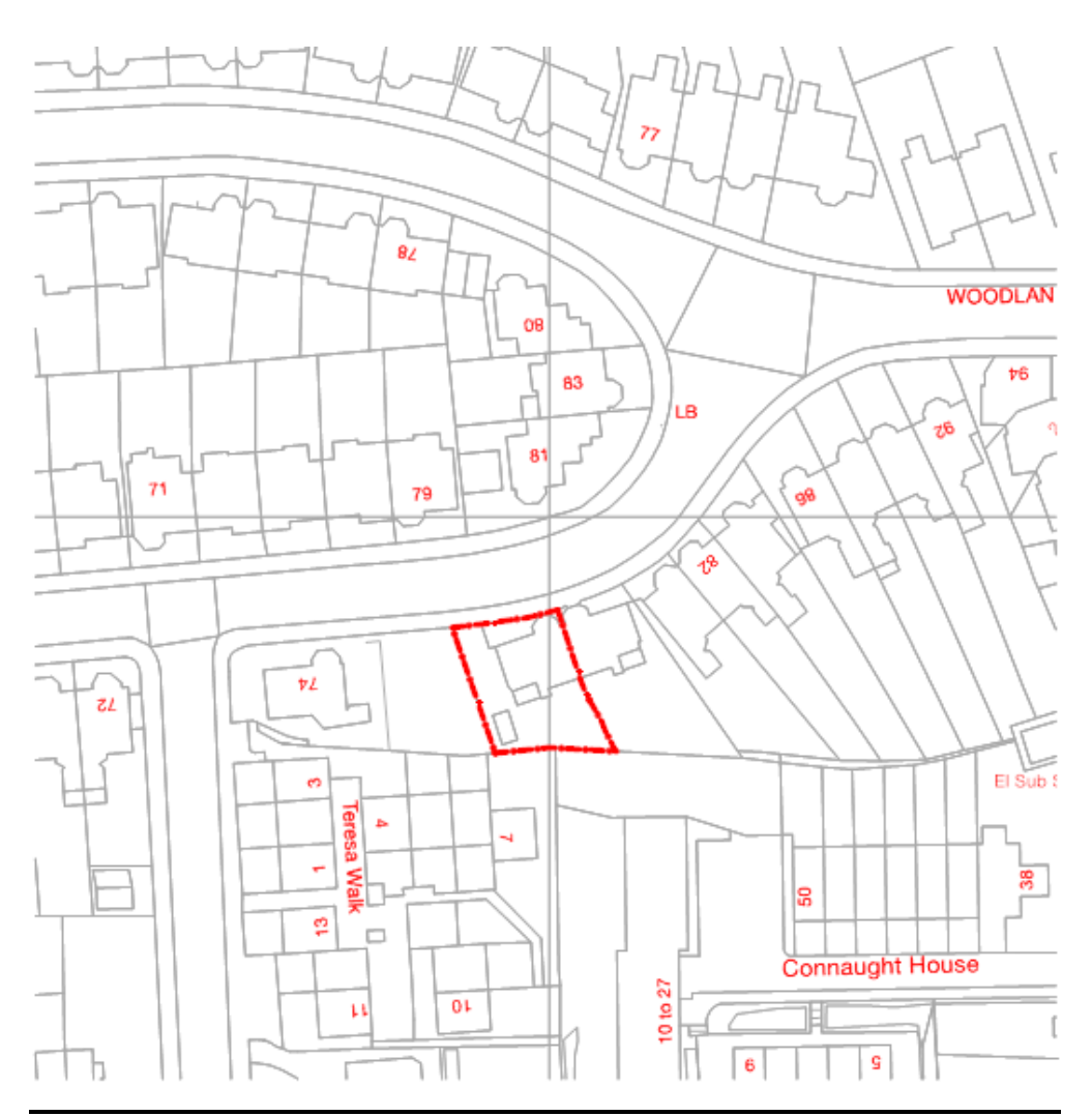
Site location plan